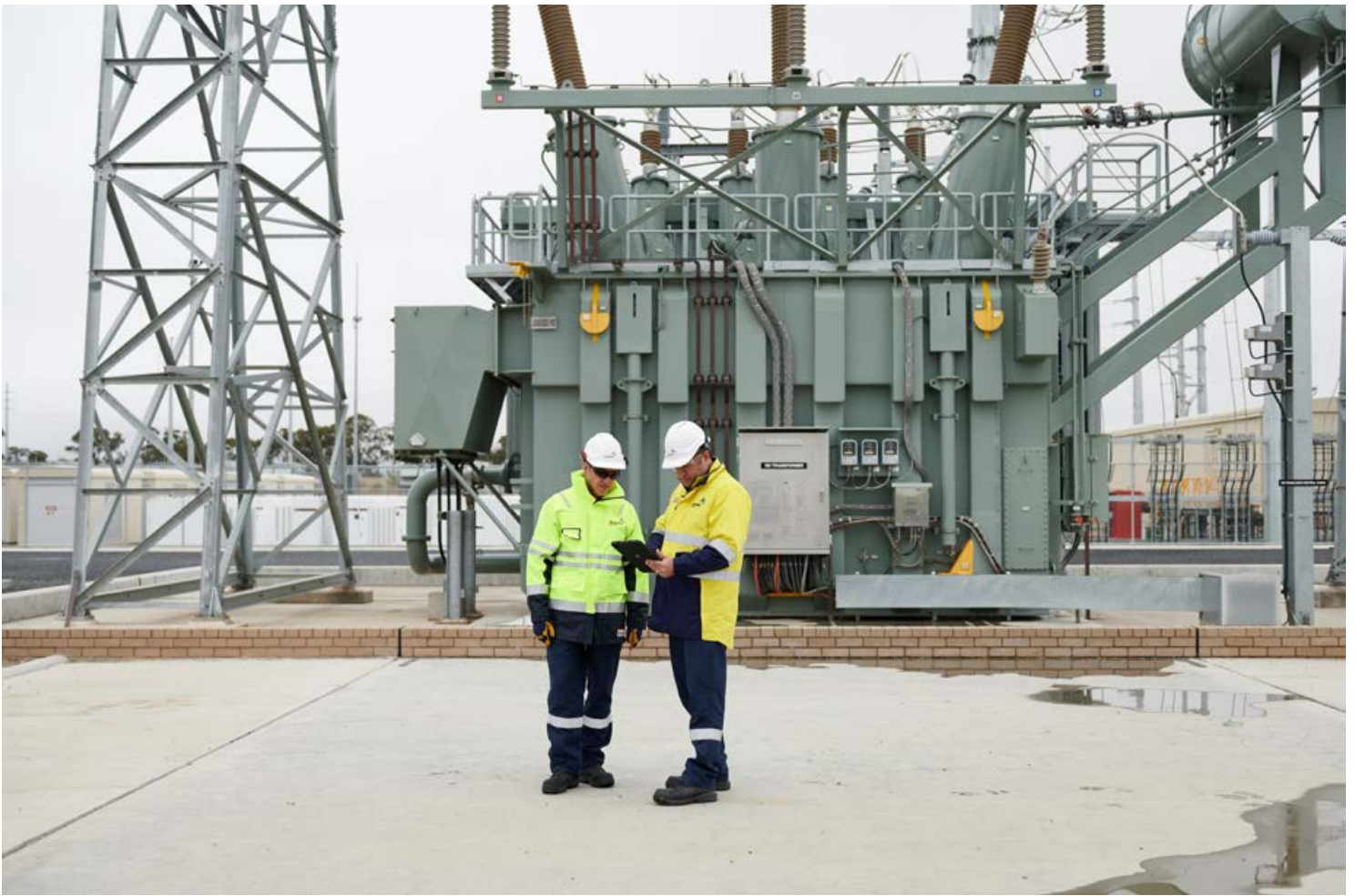
Transformers play an important role at terminal stations.